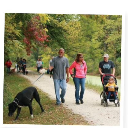
Direct Mail Processors team